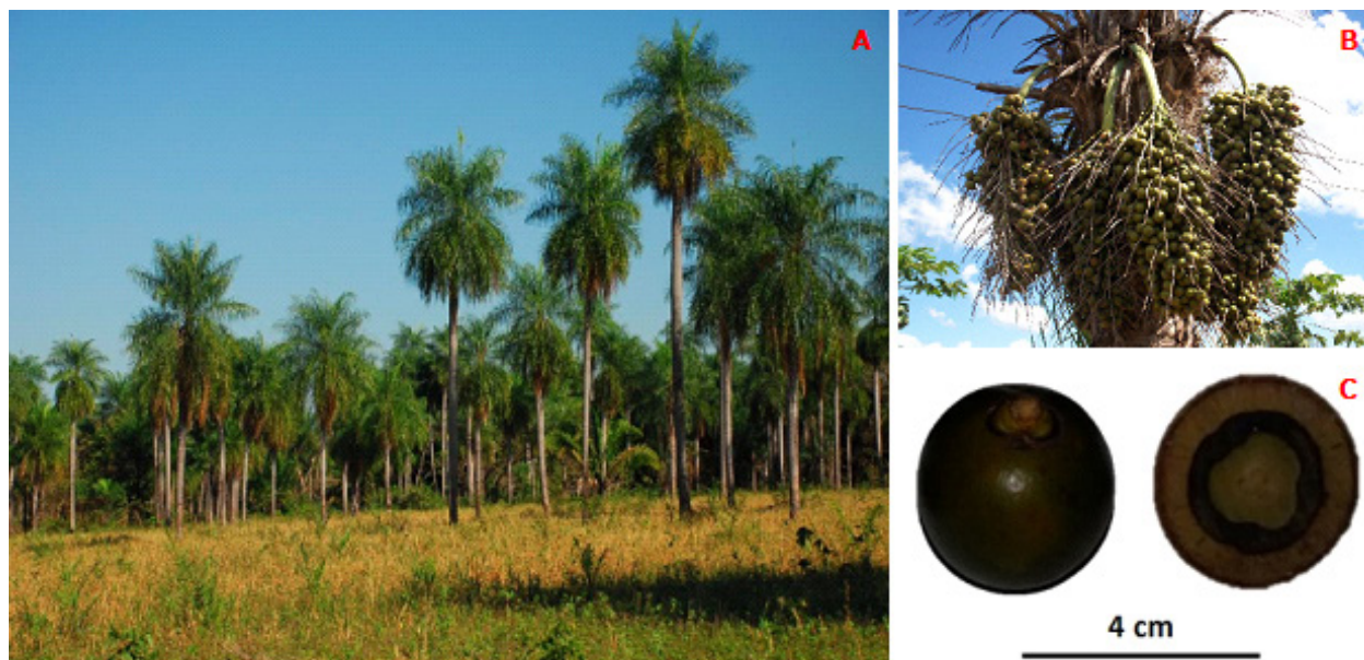
Figure 1. A. Natural population of Acrocomia aculeata in the região of Corumbá, MS, Brazil. B. Fruit bunches. C. Fruit in cross-section showing peel (epicarp), pulp (mesocarp), stone (endocarp) and nut (seed).