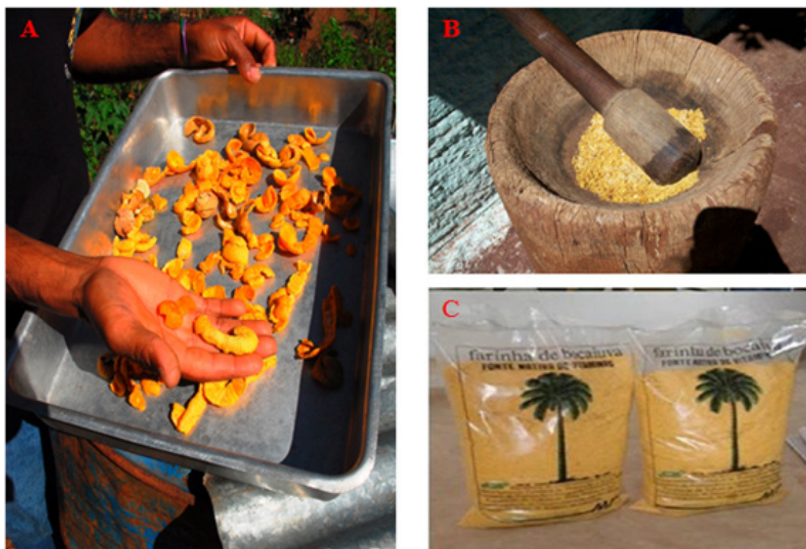
Figure 2. A. Pulp of fruits of Acrocomia aculeata being sun dried by an extractivist of the region of Corumbá, MS, Brazil, B. Wooden mortar and pestle with the pulp being ground to flour, C. Commercial flour.

Although there are available reports on the nutrient composition of the Acrocomia species (Hernández et al. 2011, Ramos et al. 2008, UNICAMP 2011), very few studies relate the nutritional attributes of the fruits and the diversity of colors observed among them. Rural extractivist communities use to associate the highest oil contents to fruits of yellow or orange pulp color. Berton (2013) found values of oil concentration above 70% for fruits with orange pulp. Given the importance of pulp color for extractivist, we study the physical characteristics and of the centesimal composition of fruits of A. aculeata with different pulp colors, in order to verify the existence